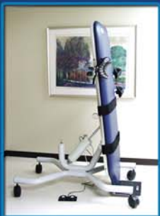
At 85 degrees