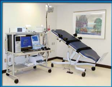
With WR Testworks Autonomic Lab

For more information on this product, please contact: